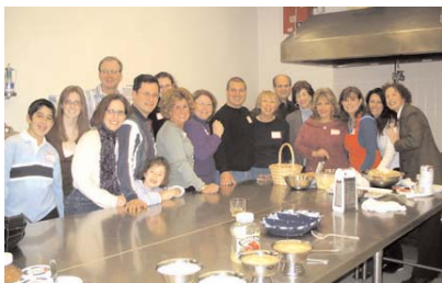
Participants at an Outreach Chanukah Party: Chanukah 101